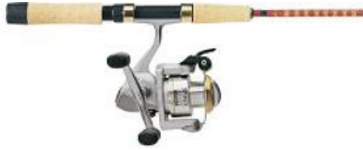
Example of a Spinning Rod & Reel